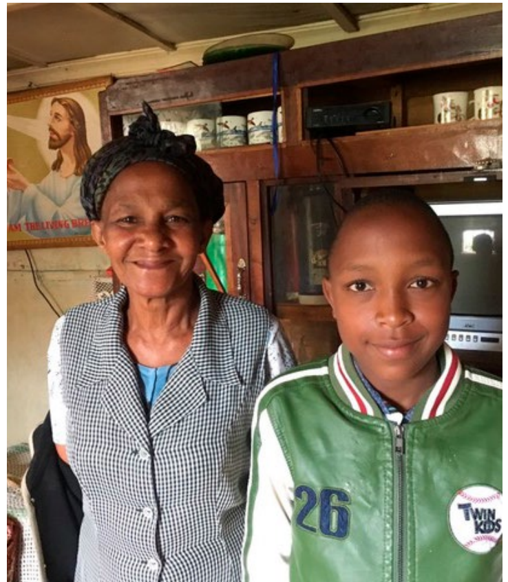
Home visits at the time of student selection.

"The elevator to success is out of order. You'll have to use the stairs, one step at a time." Joe Girard